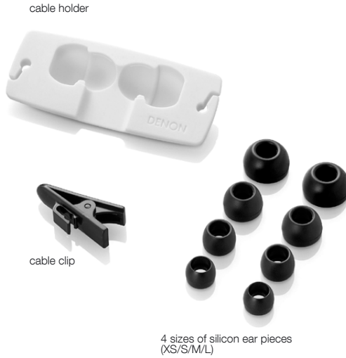
4 sizes of silicon ear pieces (XS/S/M/L)